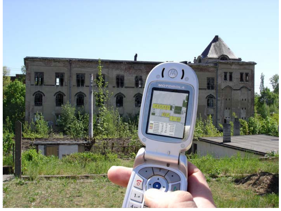
Figure 2. Cellular phone with LBS-request.

To gather more information about the building the client could search for information on the Internet. With the aid of search engines like Google<sup>TM</sup> he would type keywords such as the name of the street and the city (i.e. the position) or he would try to find phone numbers of real estate agents and ask them if they now about the building. In any case the only valuable information the client can provide is the location of the building. Location Based Services can employ this position automatically by using mobile devices. LBS can be described as follows: