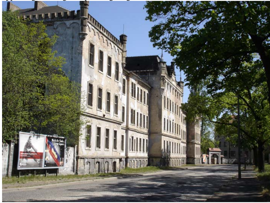
Figure 1. A typical revitalization object.

Thirdly, it is difficult to gather information about a building someone incidentally faces. Often the request to rent a building is not only made on stringent conditions. An interest could arise frequently by just passing by an appealing building or a pleasing neighborhood.